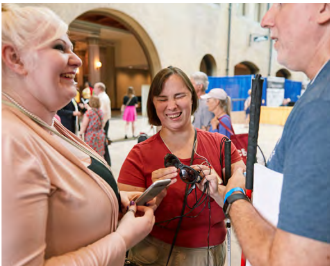
Attendees of ACB's 2018 convention learn more about Aira smart glasses at their booth in the exhibit hall.

Our thanks go to ACB's 2018 corporate sponsors. Their continued participation and generous support of the American Council of the Blind is appreciated.