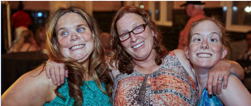
ACB members at the 2018 convention in St. Louis, MO.

Established in 1961, the American Council of the Blind (ACB) is a national organization of people who are blind, visually impaired and sighted whose mission is to increase the independence, security, equality of opportunity, and improve quality of life for all blind and visually impaired people. With 68 state and special-interest affiliates, its thousands of members have a long history of commitment to the advancement of policies and programs which will enhance independence for people who are blind and visually impaired.