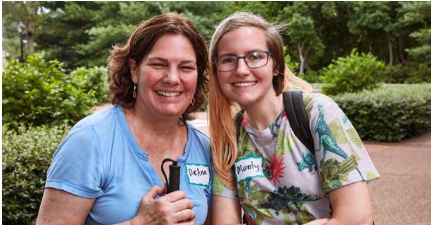
Attendees of a botanical garden sensory tour at the 2018 national conference and convention.

The 57th annual ACB conference and convention was held in Saint Louis, Missouri from June 29 - July 6, 2018, and the theme was "Gateway to Success." It was hosted by the Missouri Council of the Blind.